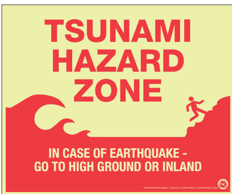
1190mm x 980mm