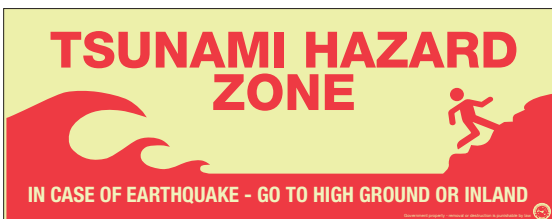
2380mm x 980mm

Please note graphics above are examples only. Customisation of the artwork is available for different provinces, regions or offices. Contact Ecoglo for more information.